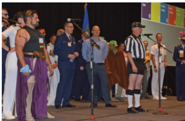
The RAM Bowl in action.