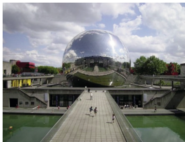
City of Science and Industry, Paris, France. ( https://www.tourby-transit.com/paris/things-to-do/cite-des-sciences-et-de-industrie-la-ville ).