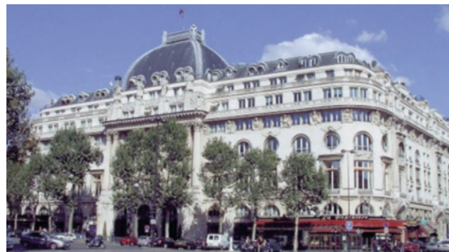
Cercle National des Armées, Paris, France (from https://structurae.net/en/structures/cercle-national-des-armees ).