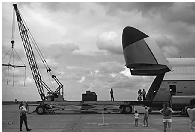
Fig. 4. Loading Skylab Mobile Laboratories (SMLs) onto U.S. Airforce C5A for transport to North Island Naval Air Station, San Diego, CA, USA.

The advent of the SMLs vastly improved logistics. The SMLs were procured from the DoD, transported to Johnson Space Center, and outfitted for support of specific experiments or activities. After the final preflight test for each mission, SMLs were transported to Ellington Field, where they were loaded onto a C5A ( Fig. 4 ) and flown to North Island Naval Air Station. The SMLs were then transferred onto the primary recovery ship. Our equipment array was left mostly assembled and ready for testing in the SML. These SMLs provided a roomier, private, controlled temperature environment for crew testing.