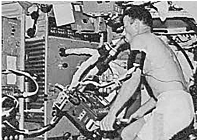
Fig. 2. Skylab in-flight experiment hardware configuration during an astronaut test.

Metabolic analyzer calibration was detailed in our prior paper on SMEAT. 8